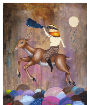
Over the Hills , Acrylic and ink on found wood, 50cm x 60cm