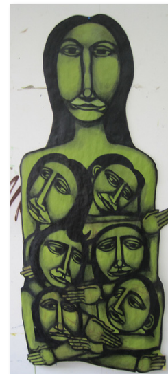
Labrona , Spray paint and oil on paper