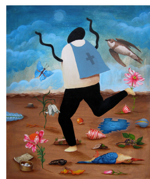
The Banishment , Acrylic on canvas, 50cm x 60cm