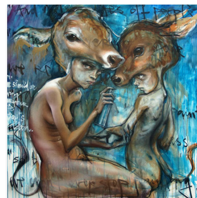
Live Your Life Like It's Golden , Acrylic, Spray Paint & Charcoal on canvas, 120cm x 120cm