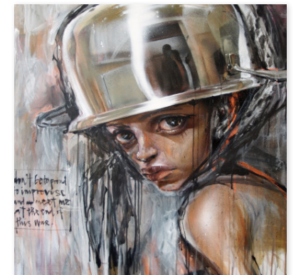
Improvise , Mixed media on canvas , 80cm x 80cm

Both artists express themselves on different bases: canvas, wood or paper. Their profoundly contrasting methods give birth to stylised works which decorate the streets with their strange uniqueness. On a background often made by Hera, Akut begins to lay strokes