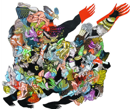
Other , Acrylic and ink on wood cut out

Other's train pieces are influenced by many uncontrollable factors, all of which add to the urgency of the art form.