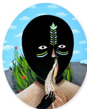
The Garden , Acrylic on board, 50cm x 40cm

He has shown in many collective exhibitions in galleries from Berlin, Bucharest, Montreal, Ottawa, Los Angeles, New York, San Jose, Copenhagen, Vienna, and Glasgow.