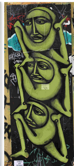
Labrona , Sao Paulo, Brazil