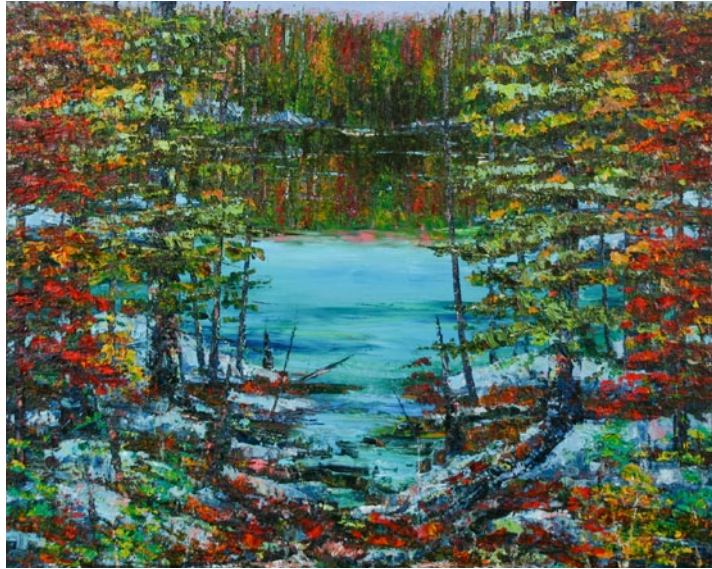
THE INVITATION, OIL ON CANVAS, 122 X 152 CM, 2012

OPENING RECEPTION APRIL 19TH FROM 17:30 TO 20:00. EXHIBITION ONGOING THROUGH MAY 16TH.