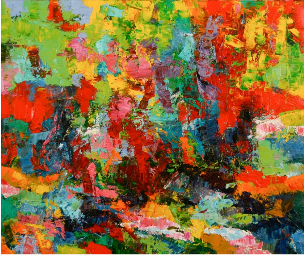
IMAGO, OIL ON CANVAS, 102 X 122 CM, 2011