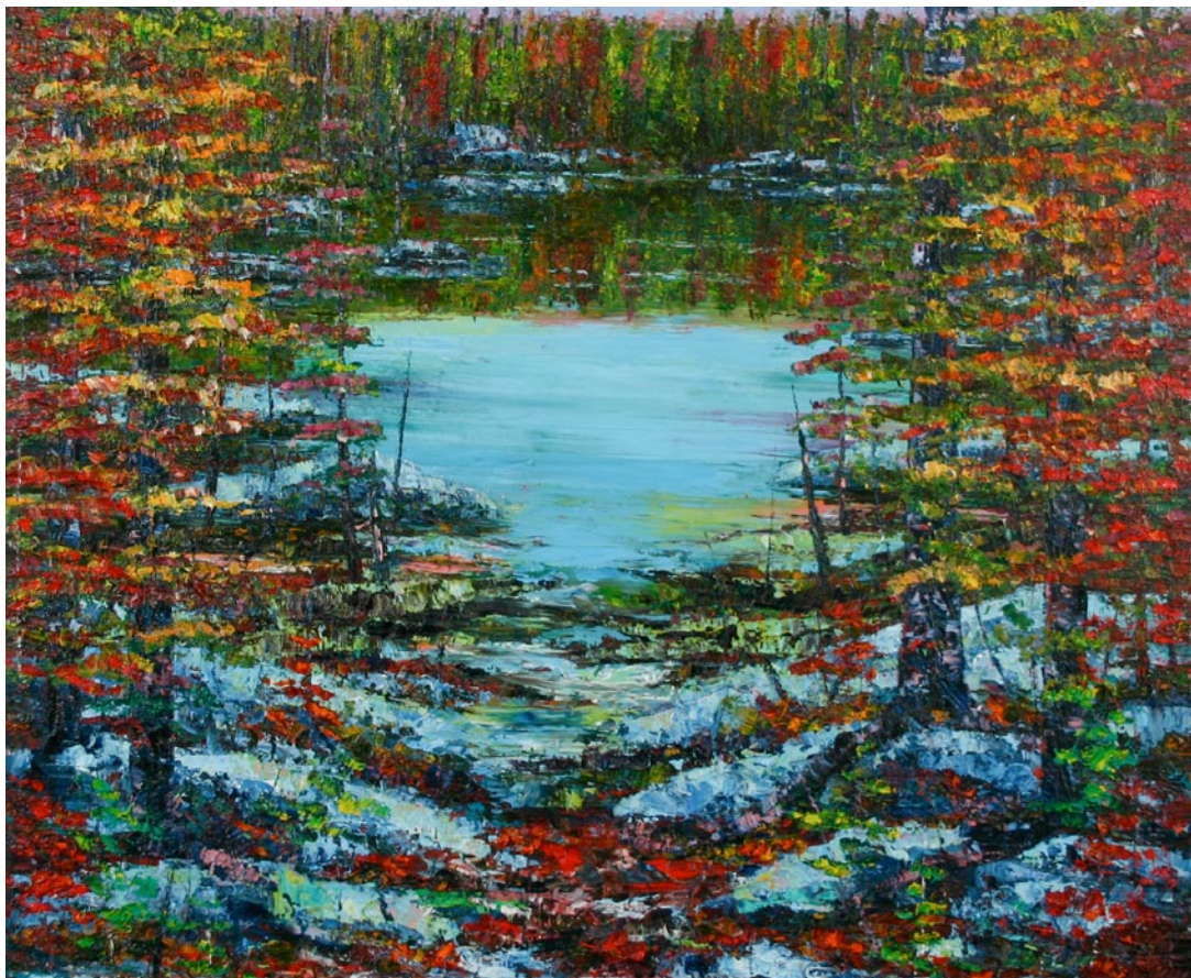
ALMOST THROUGH, OIL ON CANVAS, 152 X 183 CM, 2012