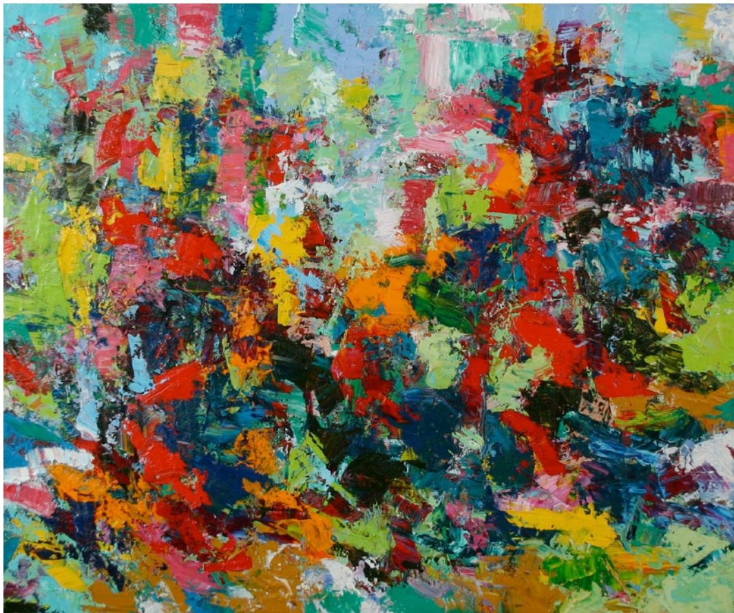
INTO THE MANY, OIL ON CANVAS, 102 X 122 CM, 2012