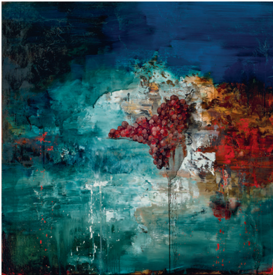
STABLE VANITAS IN BLUE, 2013, OIL ON LINEN, 91 X 91 CM