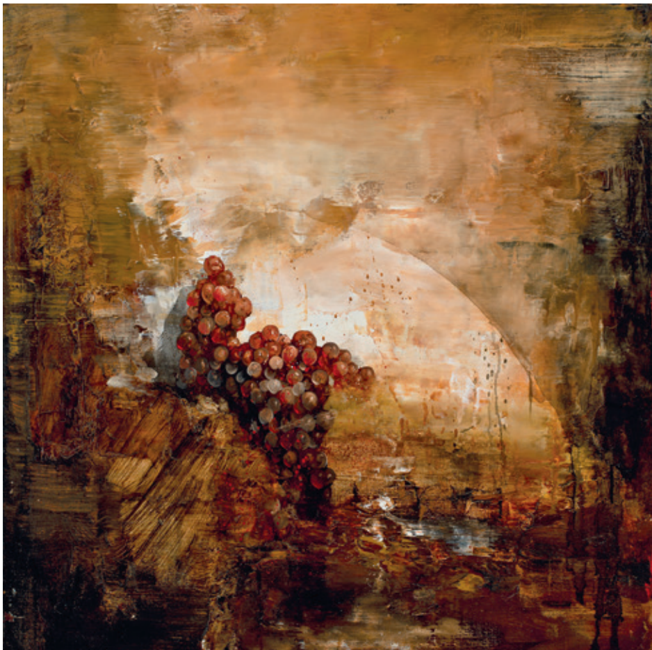
UNSTABLE VANITAS IN WHITE, 2013, OIL ON LINEN, 76 X 76 CM