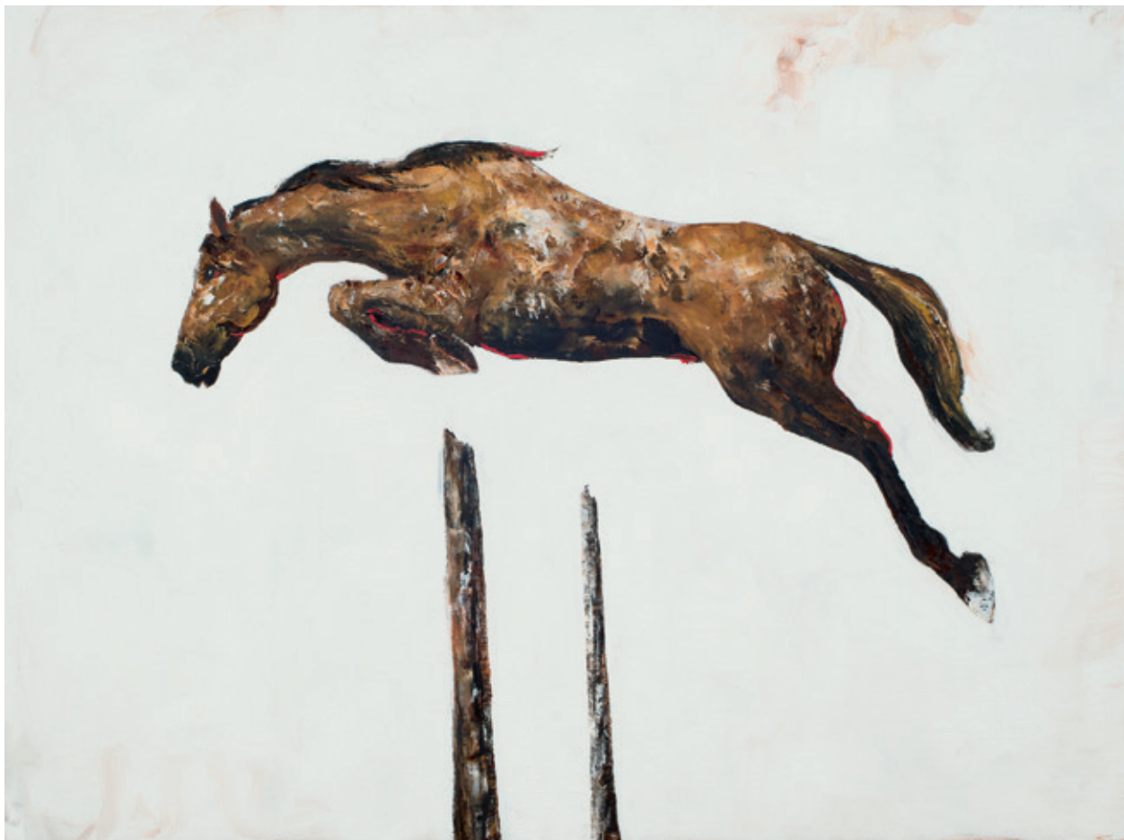
SINCERITY STUDY, 2013, OIL ON LINEN, 91 X 121 CM