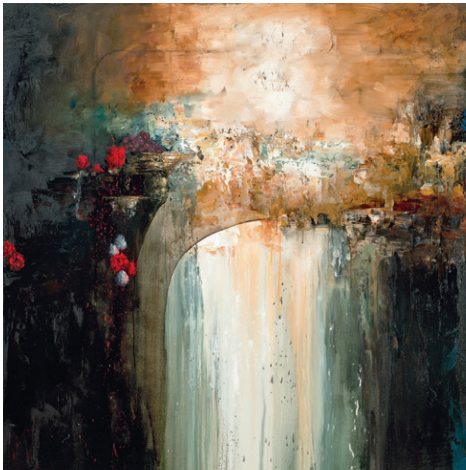
VANITY AND ITS DOUBLE, 2013, OIL ON LINEN, 152 X 137 CM