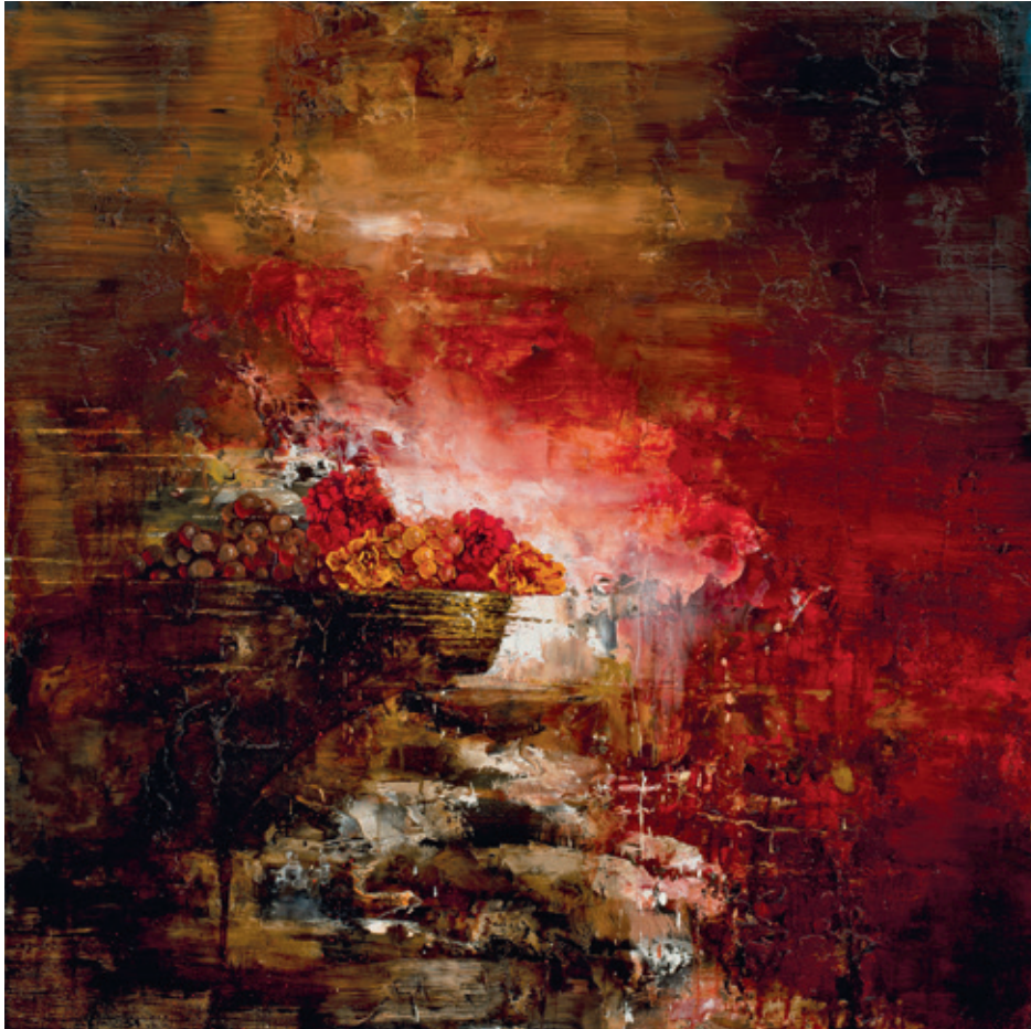
STABLE VANITAS IN RED, 2013, OIL ON LINEN, 91 X 91 CM