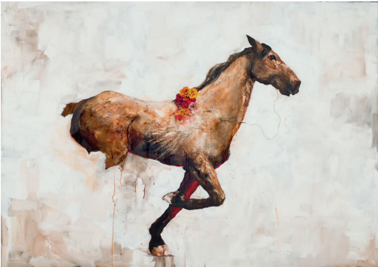
THE EDUCATION OF PEGASUS: MORALITY, 2013, OIL ON LINEN, 152 X 213 CM