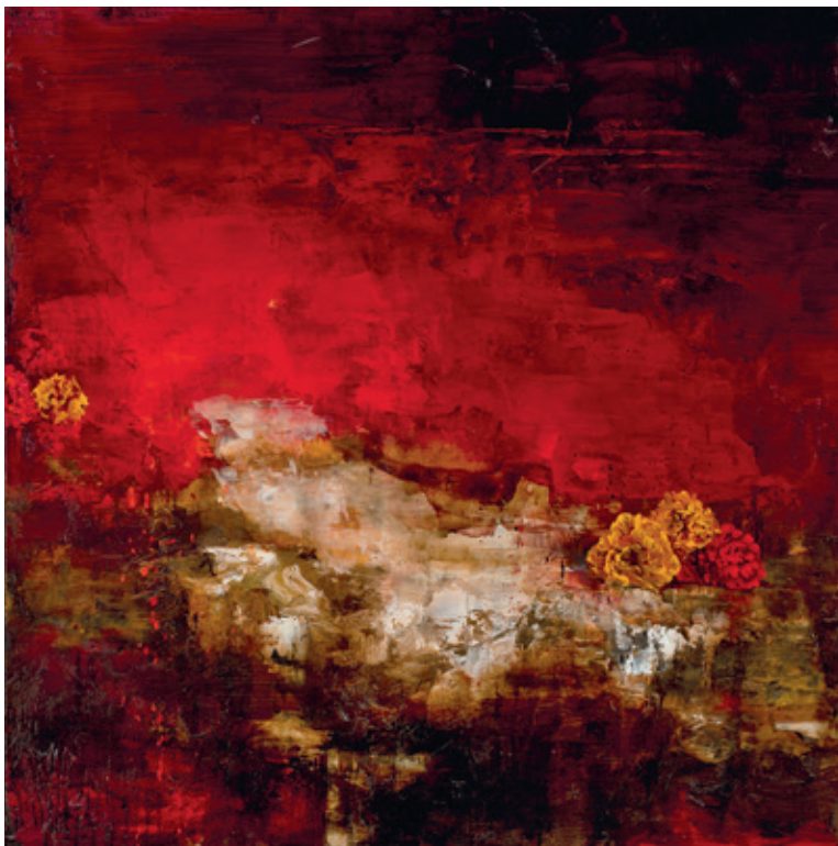
UNSTABLE VANITAS IN RED, 2013, OIL ON LINEN, 76 X 76 CM