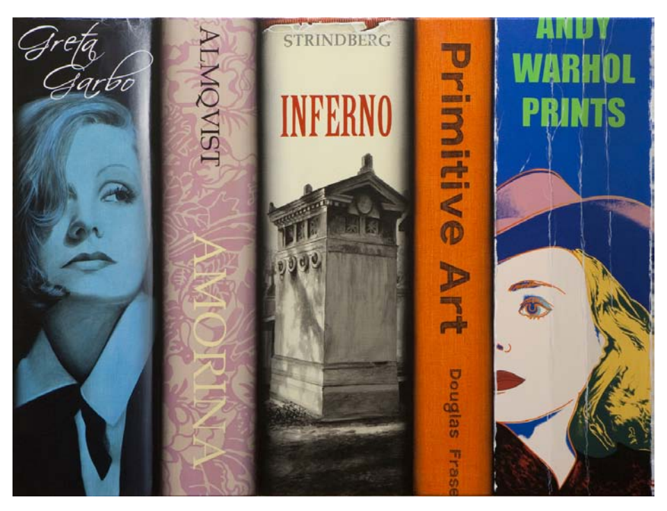
VANITAS 11.02.10, ACRYLIC ON CANVAS, 91 CM X 122 CM, 2011