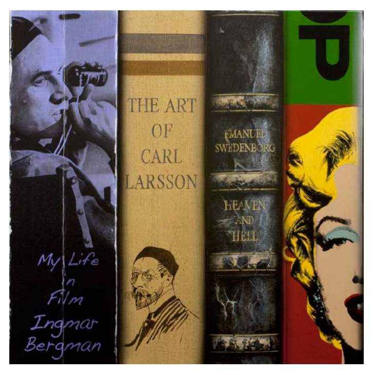
VANITAS 12.02.21, ACRYLIC ON CANVAS, 91 X 91 CM, 2011