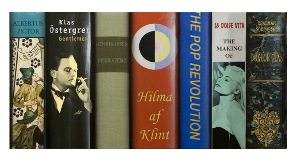
VANITAS 11.02.17, ACRYLIC ON CANVAS, 61 CM X 122 CM, 2011