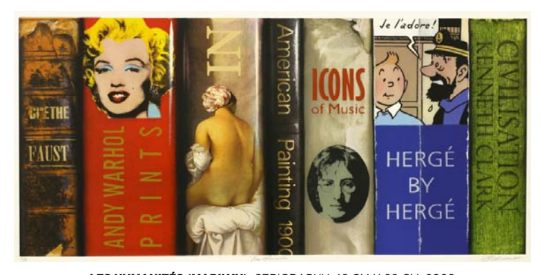
LES HUMANITÉS (MARILYN), SERIGRAPHY, 48 CM X 99 CM, 2008