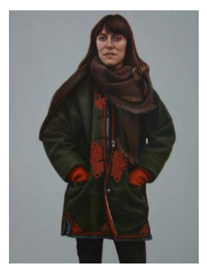
QUARTERLESS: (FEIST), OIL ON PANEL, 30 CM X 40 CM, 2011

Born 1977 in Kingston, CA. Lives in Toronto, CA.