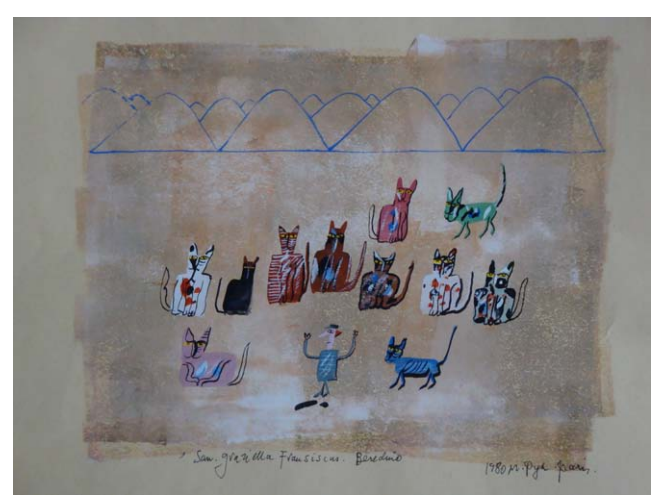
MIXED TECHNIQUE, 18 CM X 22 CM, 1980

Born 1934 in Stockholm, SE. Lives in Stockholm, SE.