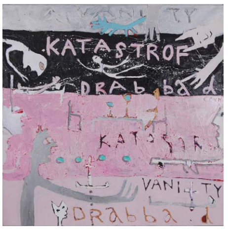
KATASTROF, MIXED TECHNIQUE, 20 CM X 20 CM, 2009

Born 1966 in Stockholm, SE. Lives in Stockholm, SE.