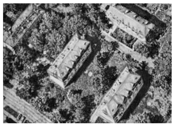
BRNO, CZECH REPUBLIC, PENCIL ON PAPER, 20 CM X 25 CM, 2009

Born 1978 in Vancouver, CA. Lives in Vancouver, CA.