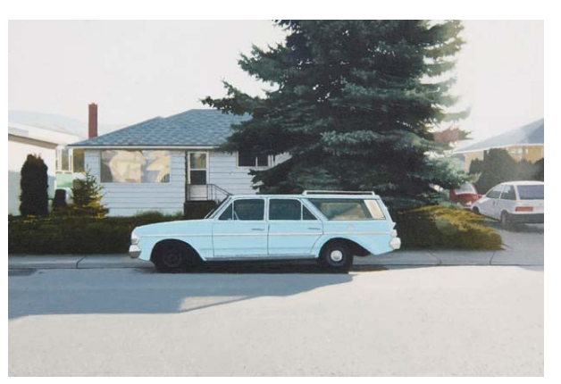
BLUE WAGON, OIL ON WOOD PANEL, 10 CM X 15 CM, 2010

Born 1977 in Ottawa, CA. Lives in Kingston, CA.