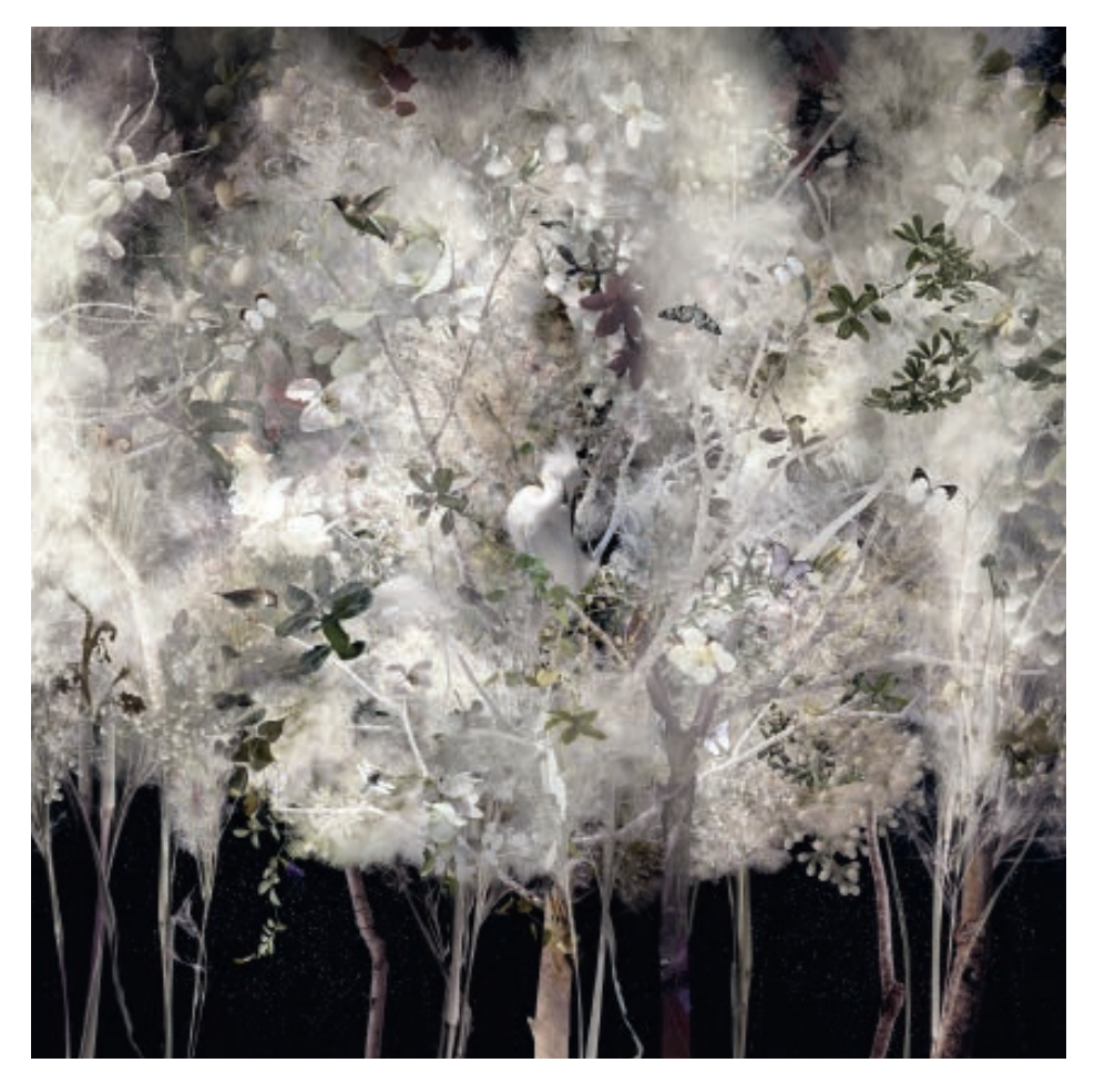
ILLUMINATED II, 2011 | ARCHIVAL C-PRINT PHOTOGRAPH, 122 X 122 CM | EDITION 7