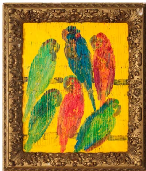
LORIES, OIL ON WOOD, 59 X 48 CM