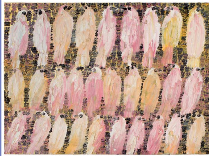
PEACE PLAN, OIL ON CANVAS, 76 X 102 CM

EXHIBITION ONGOING THROUGH OCTOBER 2 OPENING RECEPTION SEPTEMBER 8 FROM 17:00 TO 20:00 CURATED BY ANITA ALVIN NILERT, DEP,ART,MENT