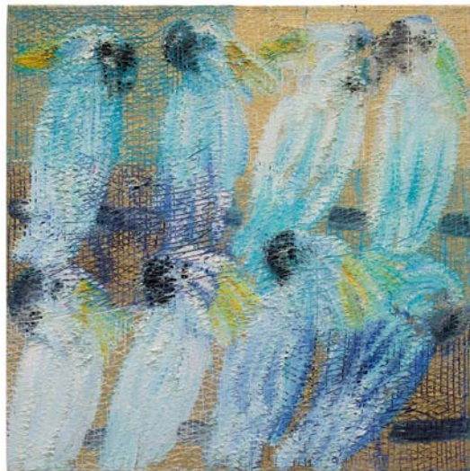
COCKATOOS, OIL ON CANVAS, 61 X 61 CM