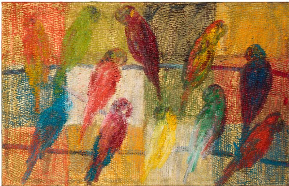
BAYOU LORIES, OIL ON CANVAS, 76 X 122 CM