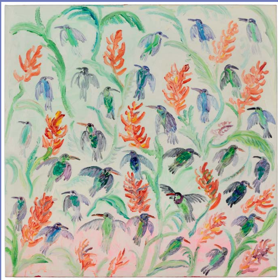
HUMMINGBIRDS, OIL ON CANVAS, 122 X 122 CM