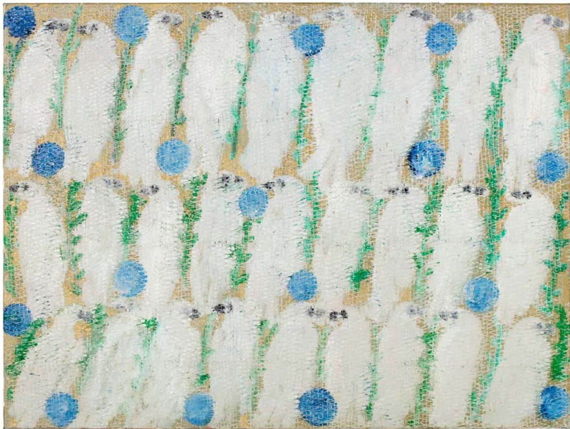
DOVES AND BLUE PEARLS, OIL ON CANVAS, 91 X 122 CM