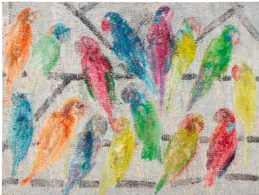
SILVER LORIES, OIL ON CANVAS, 91 X 122 CM