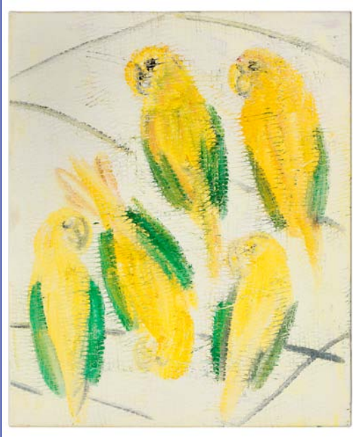
QUEEN OF BAVARIA CONURES, OIL ON CANVAS, 72 X 59 CM