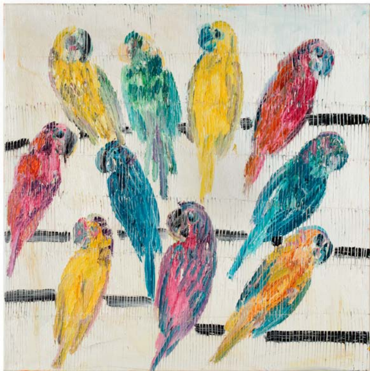
LORIES, OIL ON CANVAS, 91 X 91 CM