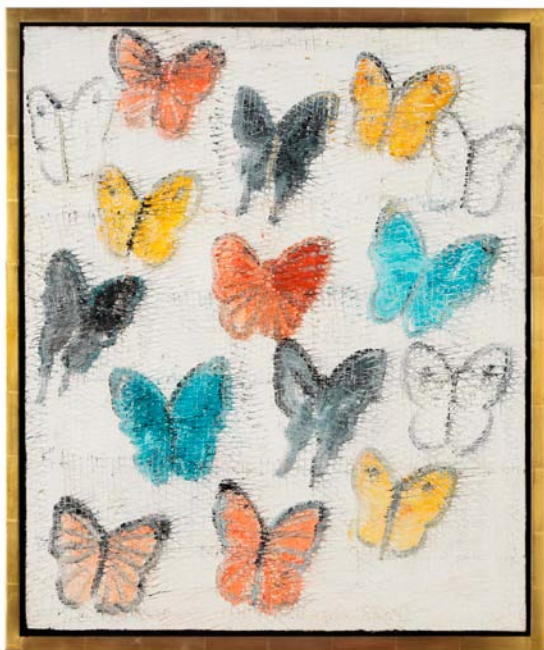
WHITE BUTTERFLIES, OIL ON CANVAS, 76 X 63 CM